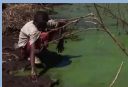
The algae clogged waters of Lake Koka

These days the water lapping at the lake's shores is green with thick blooms of algae from agricultural runoff and industrial effluent. Ethiopia's environmental legislation is designed to protect the environment from harmful chemical discharges and negligent companies but lacks adequate enforcement. The channels local people can use to raise their concerns with local government are weak and the opportunity for redress small.