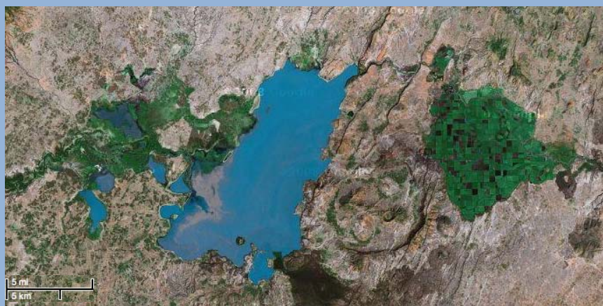
Satellite image of Lake Koka.

Once the famine stricken country of East Africa, Ethiopia has shrugged off this image with unprecedented economic development and diversification. Economic policies have promoted enormous hydroelectric dam projects and incentives for flower farms, tanneries, and the traditional coffee industry. But this economic expansion is placing new demands on the country's ecology.